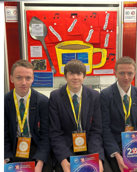
Geography Fieldwork BT Young Scientist Award Allstate NI Code Show

Lessons observed were effective in promoting successful learning, which resulted in high levels of pupil engagement, learning and enjoyment. ETI Inspection Report, June 2022