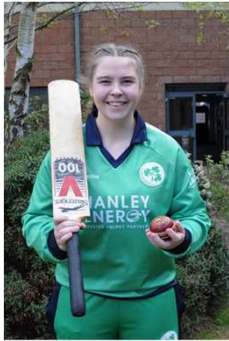
Cricket International Cara Murray