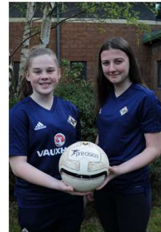
NI Football Schoolgirl Internationals