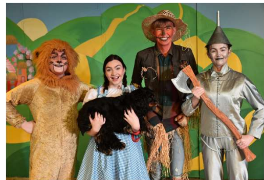
The Wizard of Oz, College Show BBC School Choir of the Year Finalists